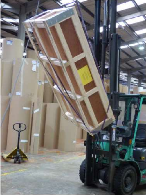
Complete Box awaiting Drop Test